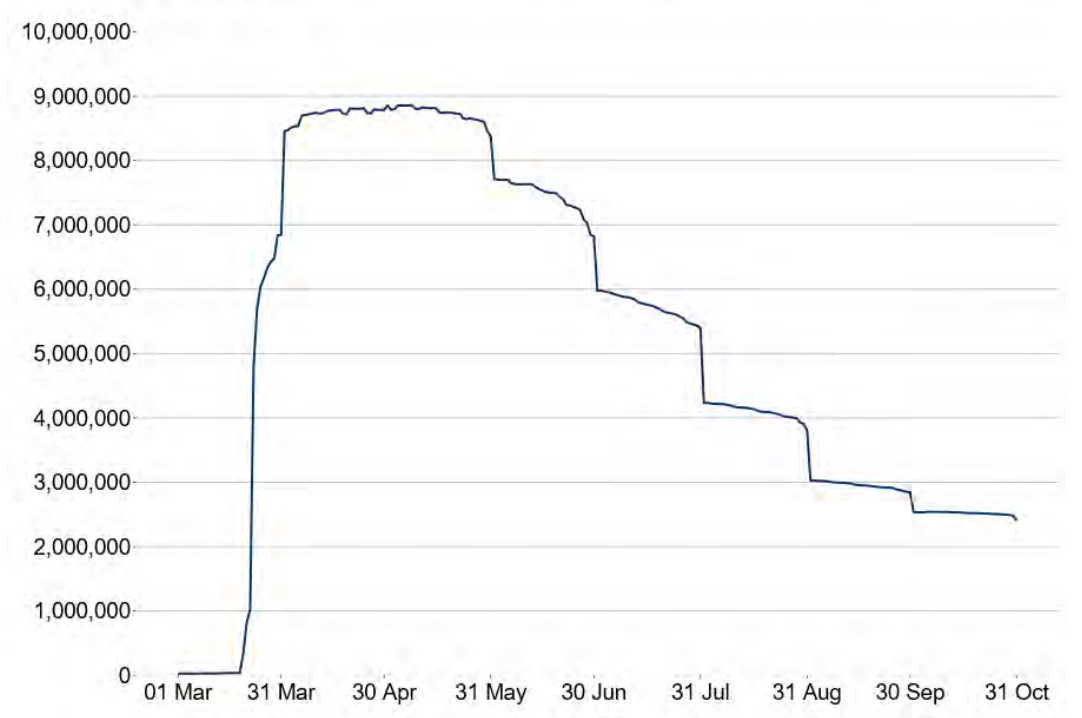
Figure 1: Total employments furloughed, 1 March 2020 to 31 October 2020

The salient fact is that by 13 December 2020, when a replacement scheme was underway,<sup>48</sup> £46.4 billion had been claimed under the Coronavirus Job Retention Scheme. The point is not that this is a lot, but how little it is. In perspective, the UK government March 2020 budget projected total spending of £928 billion, making the CJRS by then under 5% of that total, with tax receipts of £873 billion.<sup>49</sup> The fact that a peak of 8.86 million people were paid 80% of wages by the government, over a quarter of the 32.8 million workforce,<sup>50</sup> with under 5% of the UK government budget, indicates two main things. First, it shows just how extreme income inequality has become. There is vast wealth accumulated by private enterprises, and even government spending dwarfs the sums of money that most people receive. Second, it shows how much value is taken from people's labour. The people who create The Wealth of Nations , like Britain, get far less than they have earned.<sup>51</sup>