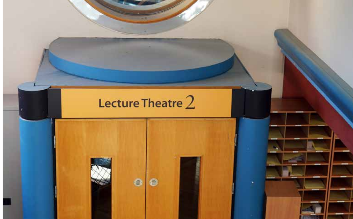
Three of the Lecture Theatres in the Addenbrooke's building