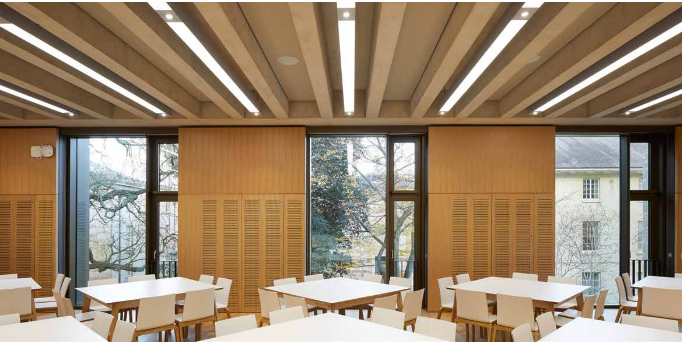
Dining rooms on the second floor