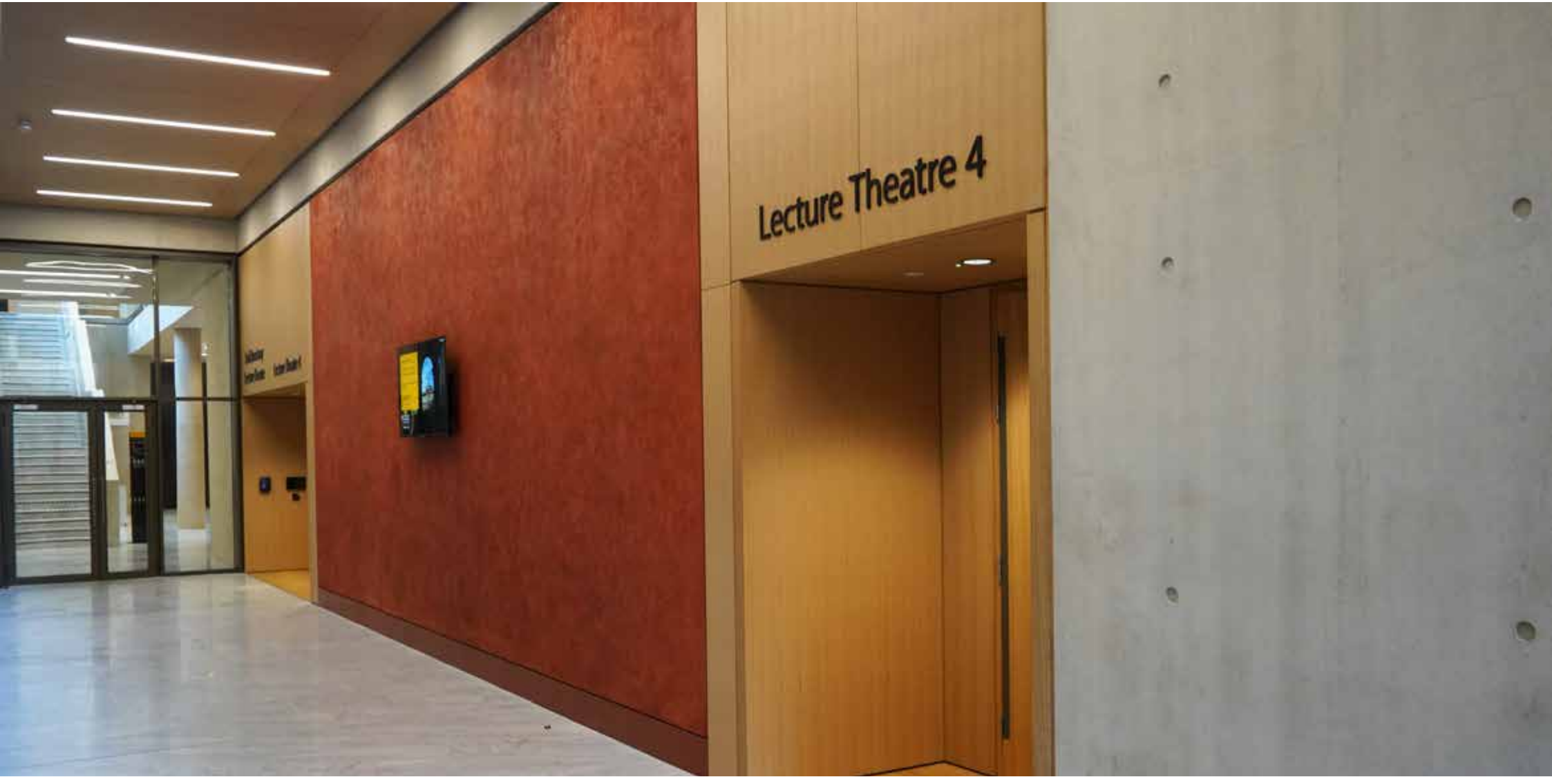
Lecture theatres access corridor on the ground floor