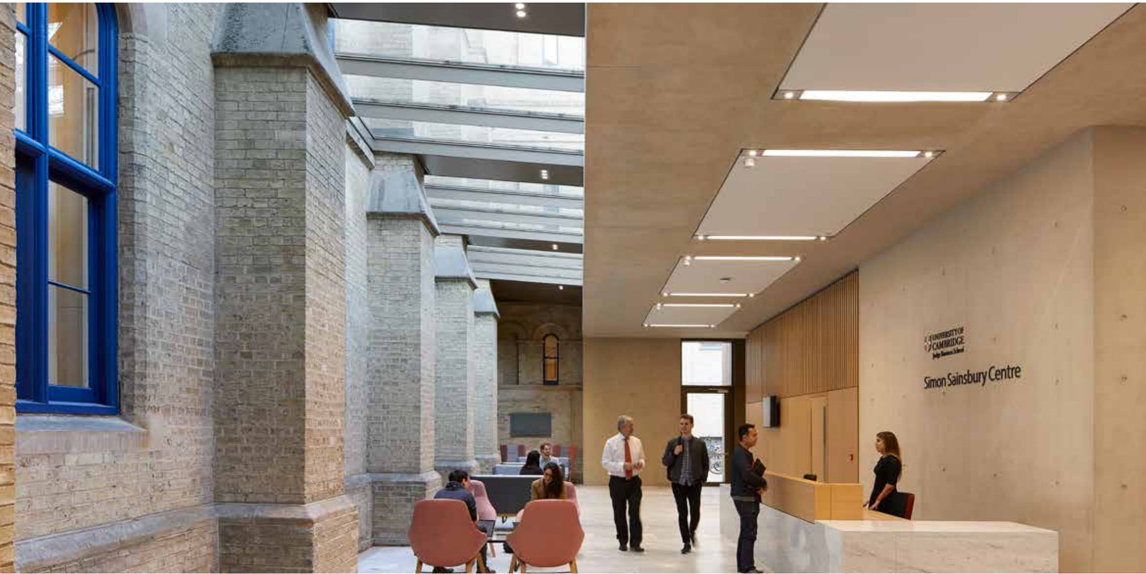
Main entrance/reception area on the ground floor