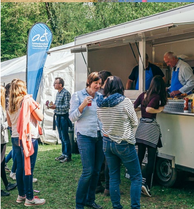
Three Counties Charity Walk.