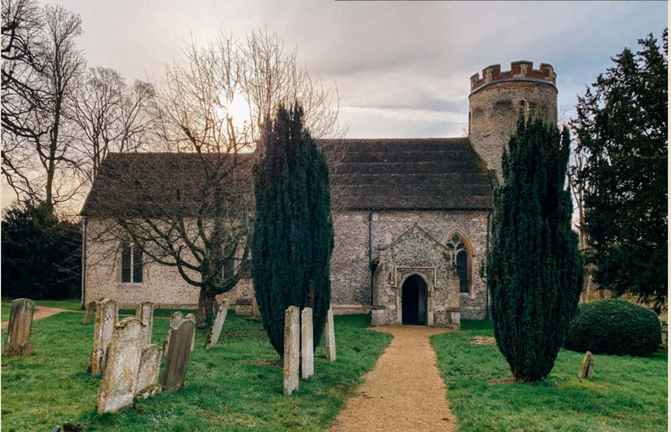
Clockwise: The stained glass of the East window; The nave with the medieval wall paintings; The Bartlow Hills; The view of the Norman circular tower and the north doorway with yew trees.