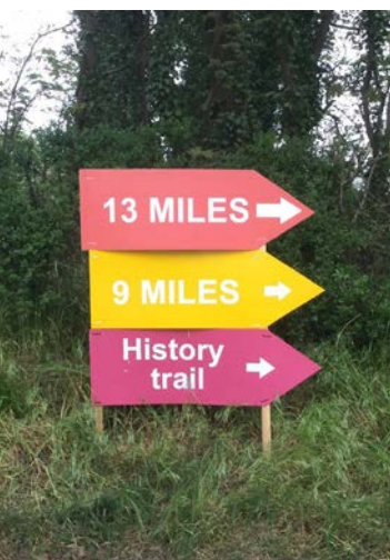
Charity Walk's signposting.

St Mary's Bartlow community support is manifest in 20% of the village population signed up for the church cleaning and flower rotas. In addition, many non-regular attenders come to the church to offer help with various tasks and activities.