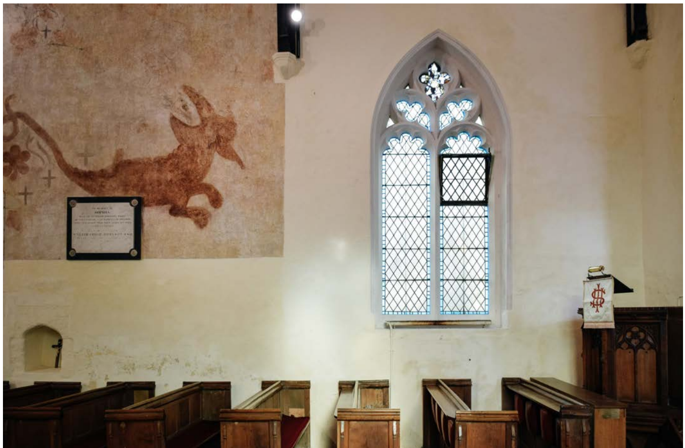
Restored medieval wall paintings on the south (top) and north walls (bottom).