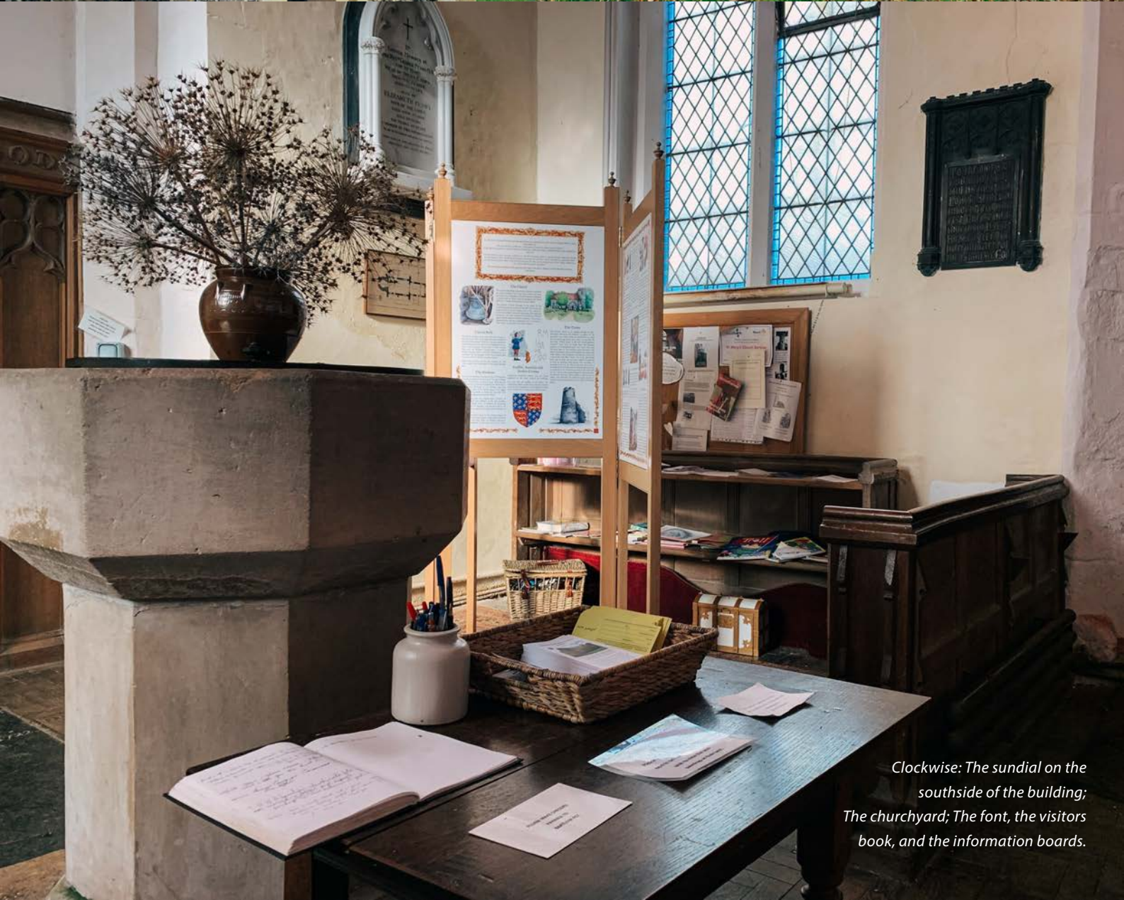
Clockwise: The sundial on the southside of the building; The churchyard; The font, the visitors book, and the information boards.