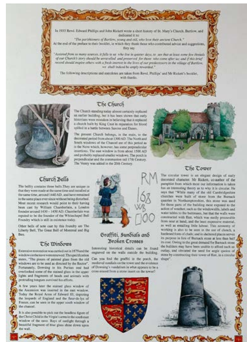
One of the information boards in the church telling a story of its architectural features

In light of the good church family links and church artefacts, the PCC anticipates that there is a scope for a Friends of St Mary's Group.