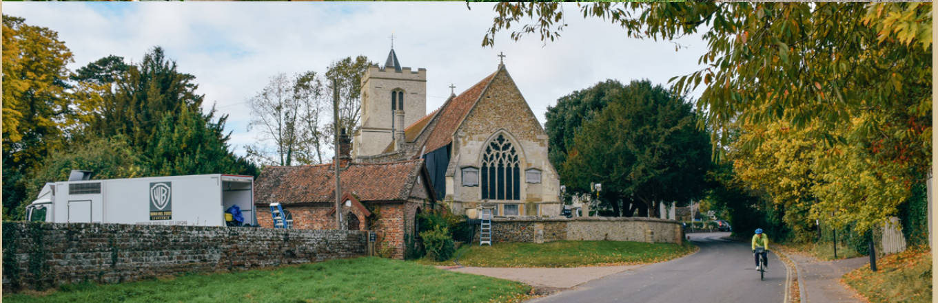
Top: Eastern view of Grantchester church. Middle: Church tower and northern entrance; Village road sign. Bottom: View of the church from Mill Way during the filming of the TV series 'Grantchester'.