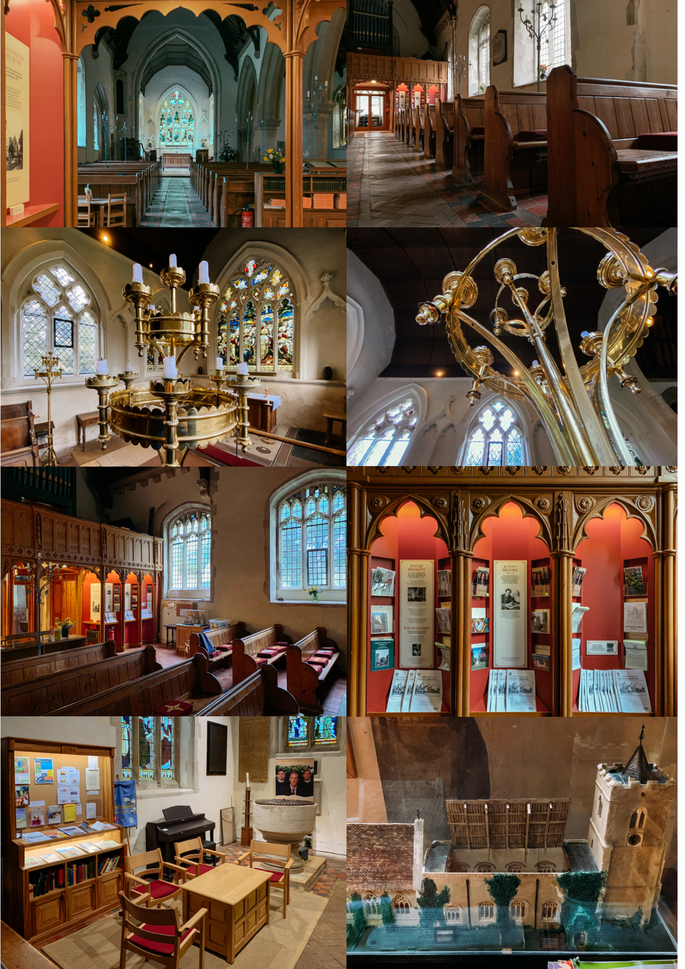
Top: View of the nave from the entrance; Seating arrangement in the nave. Middle rows: The chancel and candle stands; Information stand with publications on sale at the back of the nave. Bottom: The font and the literature display; The model of Grantchester church made by Samuel Page Widnall in c. 1876.