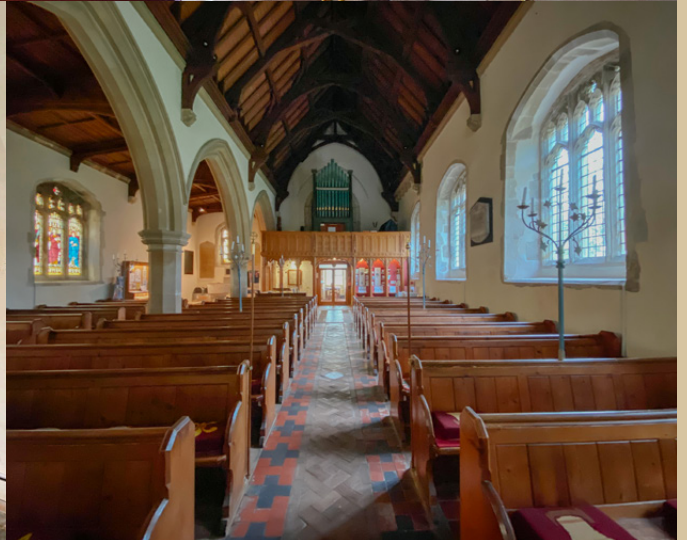
Top: View from the nave towards the chancel and East window. Middle: The chancel and East window decorated with fresh flowers. Bottom: Norman font and 'Grantchester' TV series banner stand by the west wall; View from the nave towards the vestry and the organ.