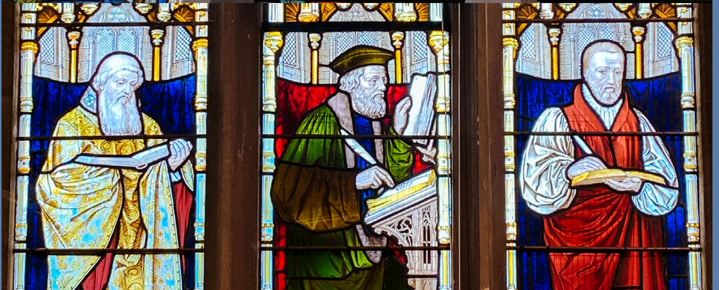
Stained glass in the East window (top), south wall of the chancel (middle) and the nave (bottom).