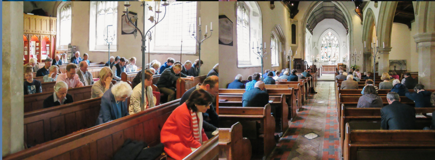
Clockwise from top: Bishop of Ely, the Right Reverend Stephen Convey visits Grantchester church; Easter service 2019; Church services; After service coffee; A Confirmation Service (Photos by Grantchester church).