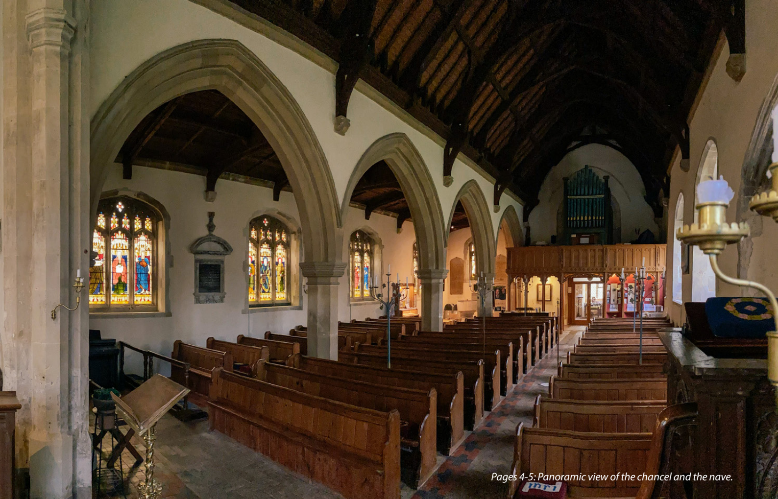
Pages 4-5: Panoramic view of the chancel and the nave.