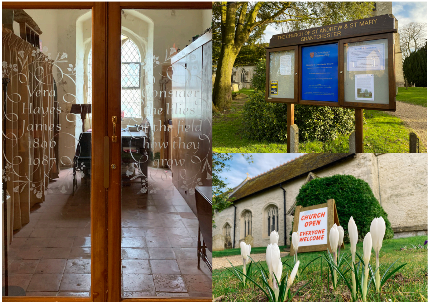
Glass doors of the vestry and church noticeboards.