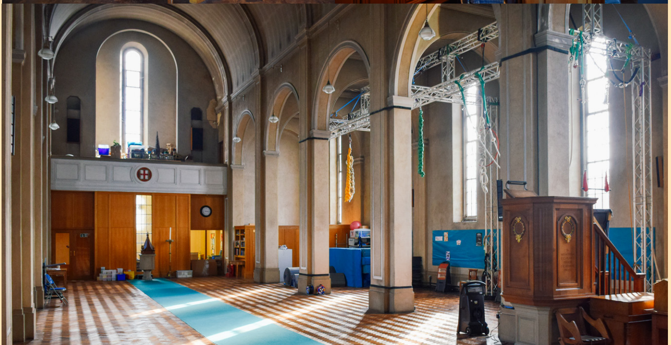
Top: View of the church nave from the balcony. Middle: Bookshelf and kitchen space. Bottom: Church nave with removed chairs.