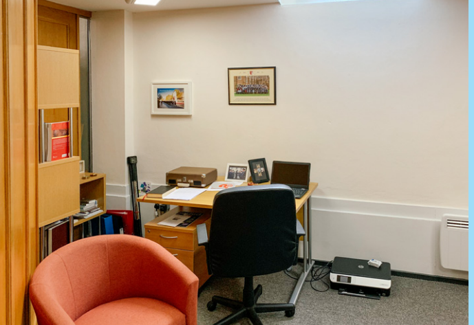
1st row: Car park in front of church hall; Large room in the church hall. 2nd row: Meeting room with glass window. 3rd row: Office rooms in the church. 4th row: Kitchen in the church hall; Office space in the church.