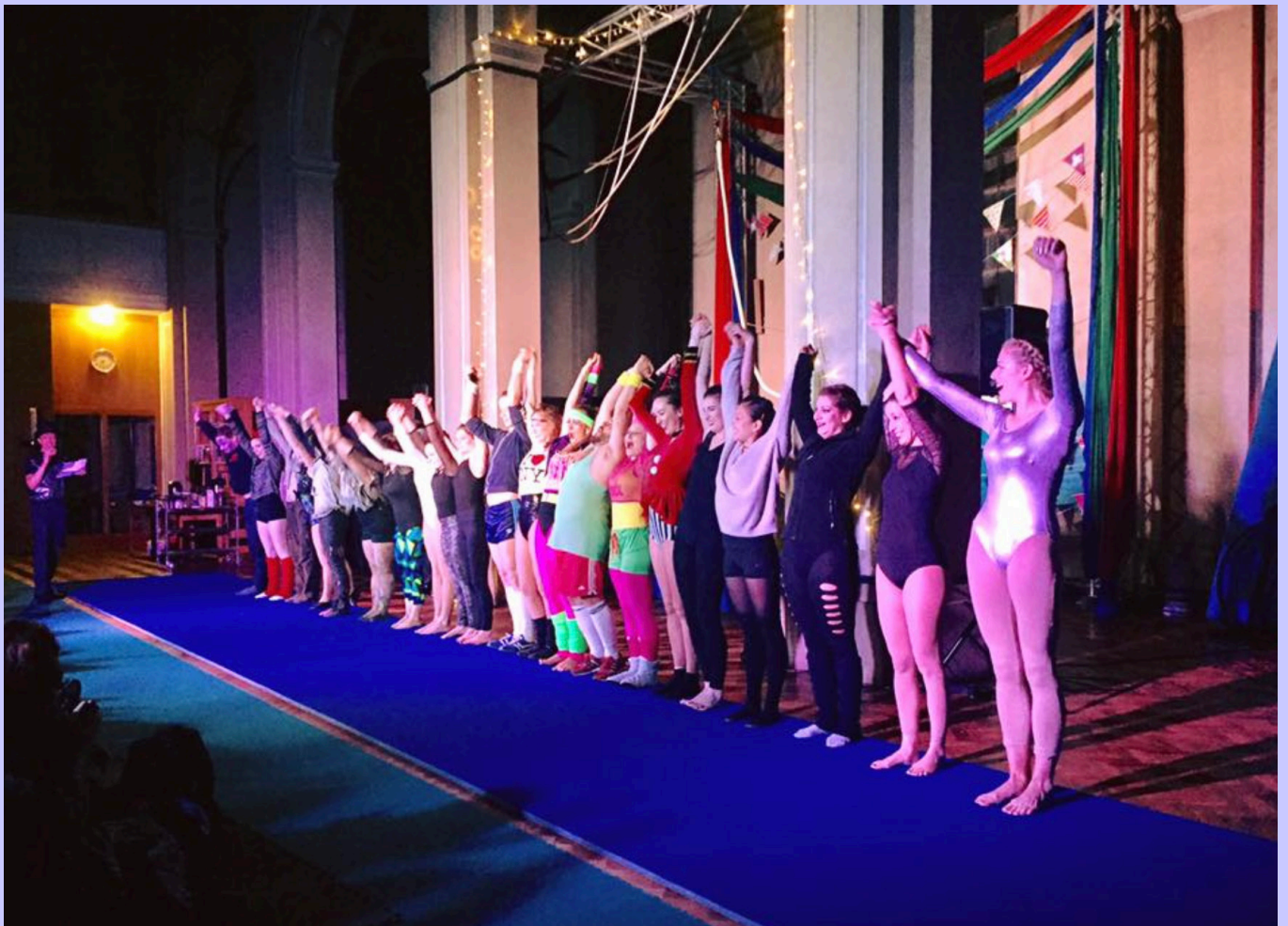
Cambridge Community Circus performances at St George Chesterton.