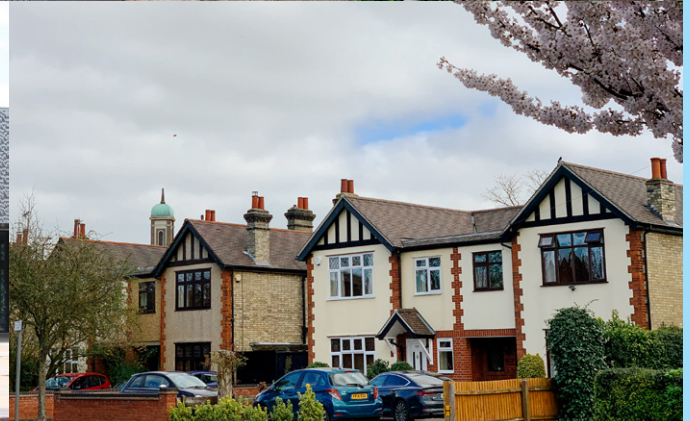
Top: View of the church entrance from Chesterfield Road. Middle: Church hall entrance and car park next to the church. Bottom: New railway station Cambridge North; Church tower seen behind houses on Milton Road.