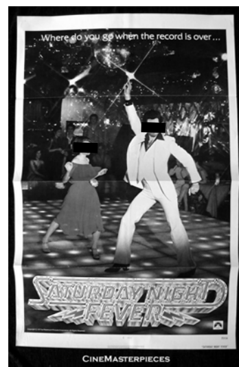
Saturday Night Fever