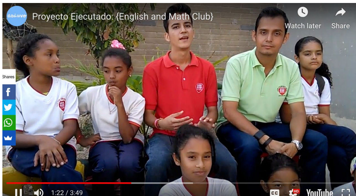
Post-implementation video report example: English and Math Club Project, Barranquilla