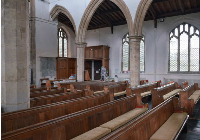
Top: Southern side of the church building. Bottom clockwise: Pulpit; Stained glass of Saint Wendreda; Wooden pews and the central aisle.