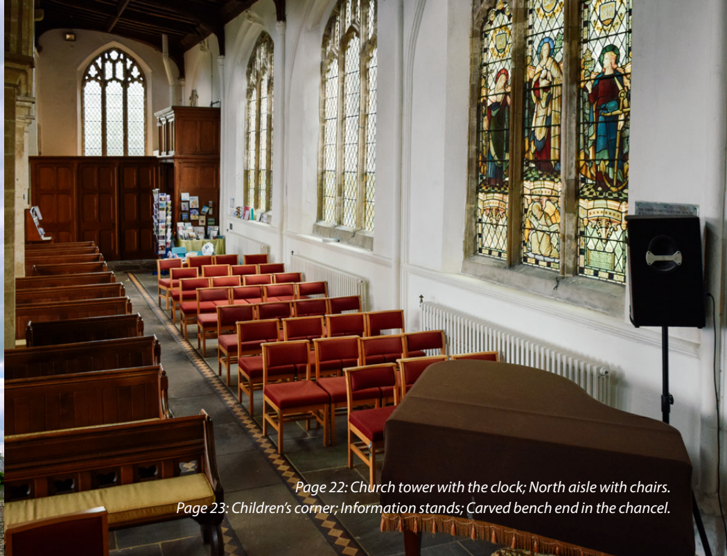
Page 22: Church tower with the clock; North aisle with chairs. Page 23: Children's corner; Information stands; Carved bench end in the chancel.