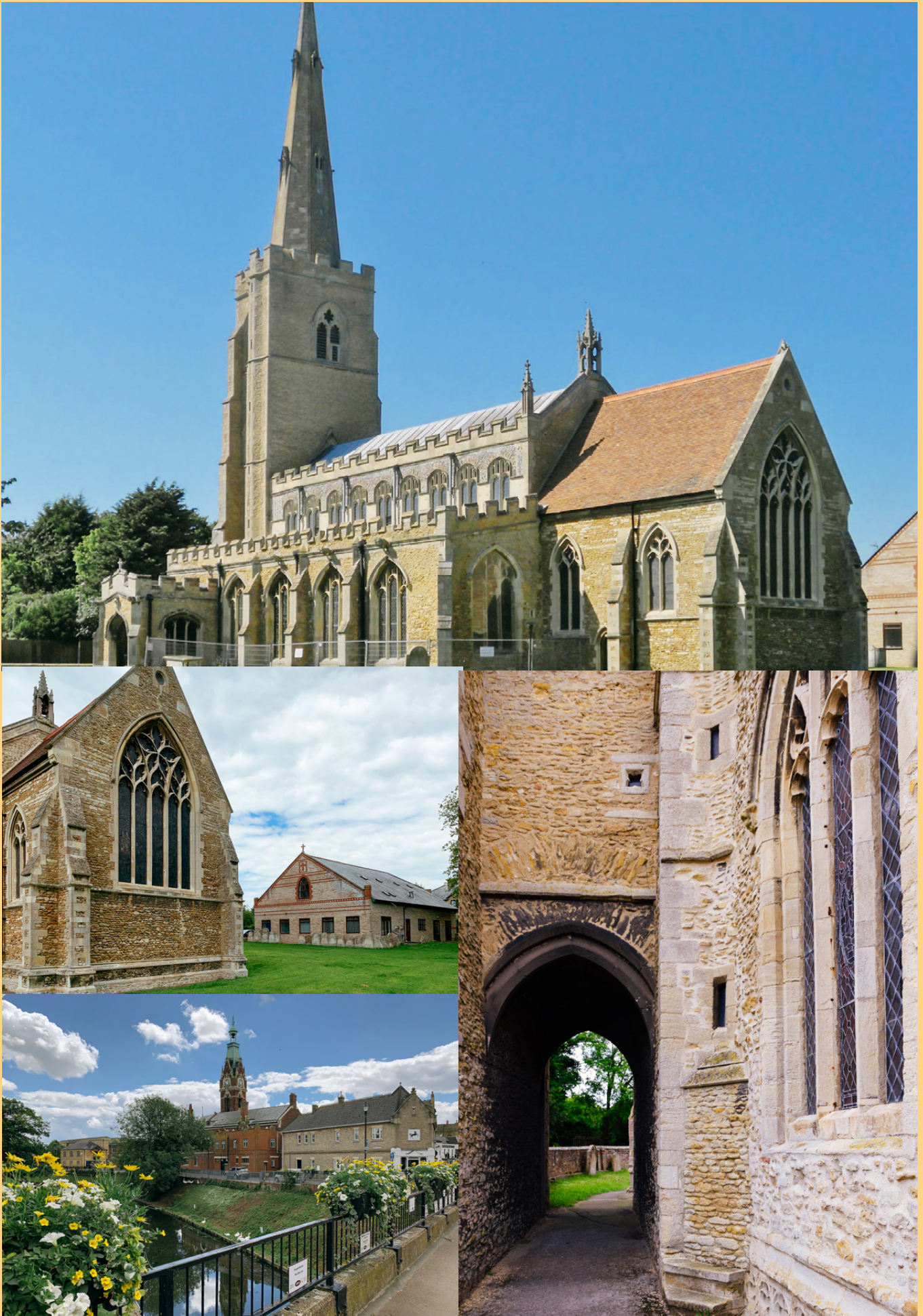
Top: South-eastern side of the church building. Bottom clockwise: East window and St Wendreda's church hall; Passage through the base of church tower; River Nene in the town of March.