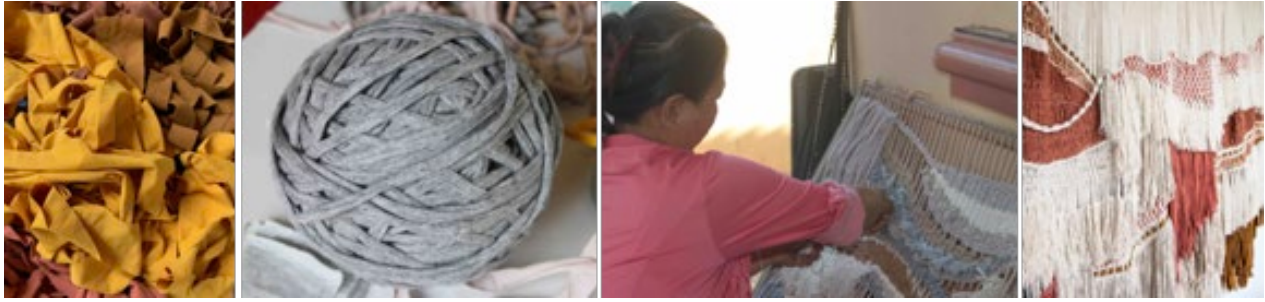
Figure 2. Repurposing materials at Tonlé. Left to right: scraps of fabric are cut; fabric is given new purpose as yarn; repurposed yarn is woven; completed items are created