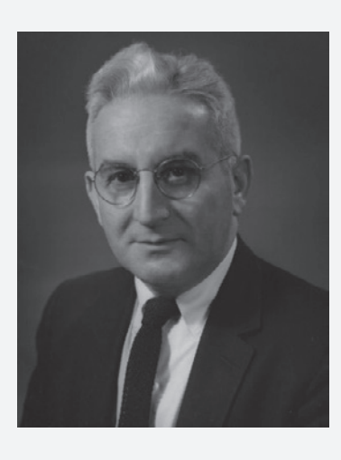
Image 1: Herman Kahn of RAND Corporation (National Archives, 1963)

The value of Shell's futuristic approach was first realised in the 1973 Arab–Israeli (Yom Kippur) War, when the first oil embargo caught most companies by surprise. Shell had considered and strategized for the implications of an oil price shock, and thus overcame the worst shocks, and emerged from the crisis as the sector leader.