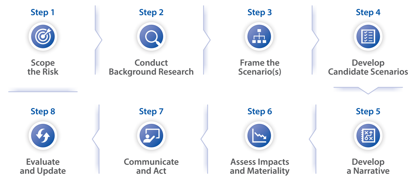
Figure 4: Outline of the scenario development framework for the insurance industry