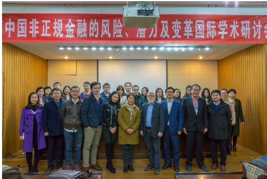
Members of the Cambridge, Renmin and Hunan teams meeting at Hunan University, January 2018