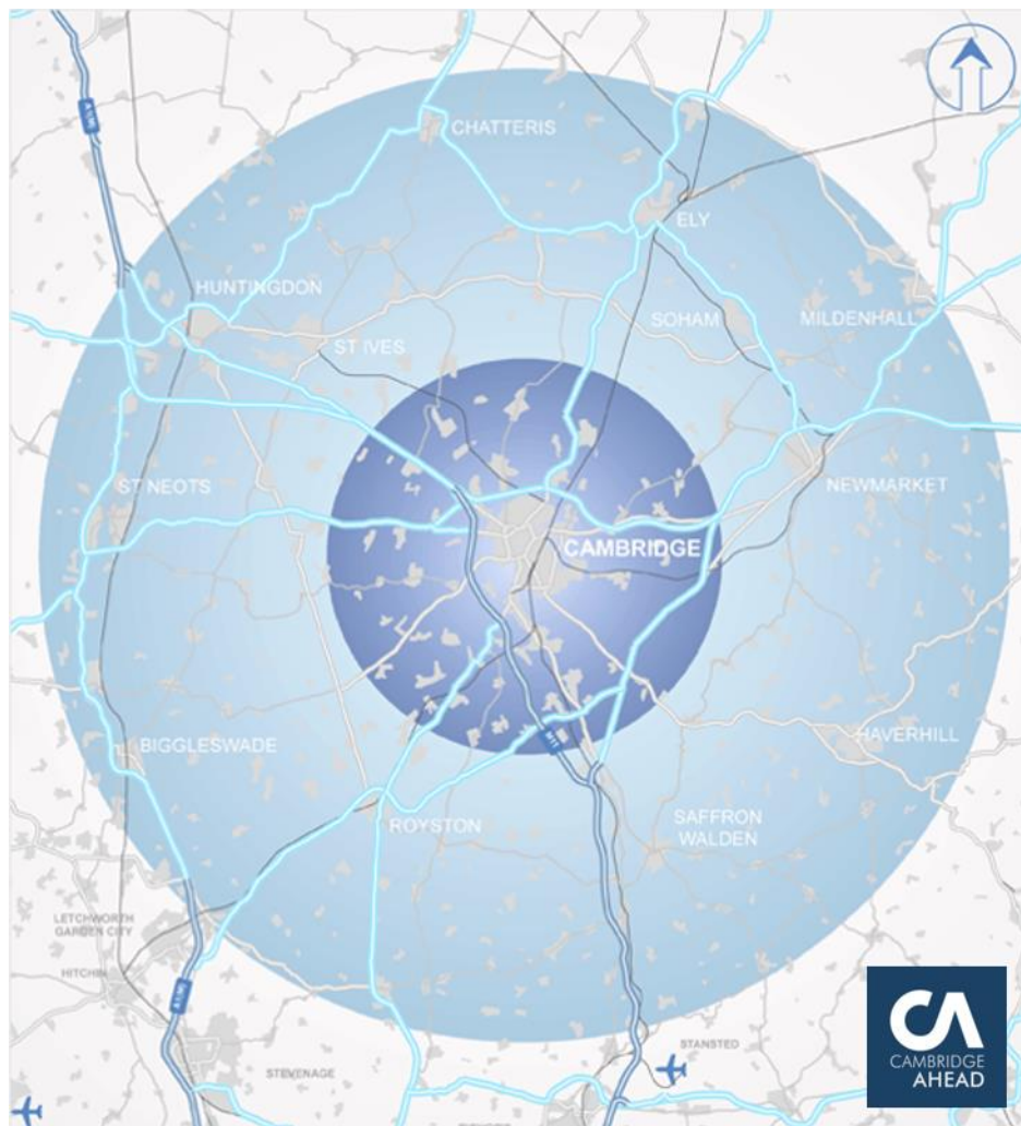
Figure 1 Cambridge Ahead area

The Cambridge based companies were then selected as companies with either their registered office, or their primary trading address, in one of the Cambridge Ahead postcodes. The location of each company for mapping purposes was taken to be the postcode of its primary trading address. In many cases the primary trading address was not provided. In general, the registered office address was then used as the location postcode. However, in many cases local knowledge and internet searches enabled us to identify a primary trading address despite it not being found on FAME. The whole of a company's operations is displayed at its primary trading address even if it operates at several locations in the Cambridge area. The database has over 26,000 Cambridge based companies in the Cambridge Ahead area alive in 2019/20.