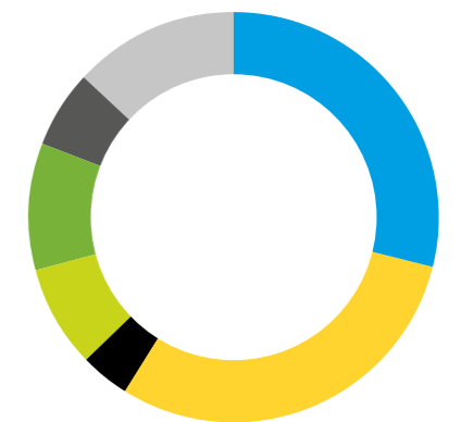
Post-MBA sector employment