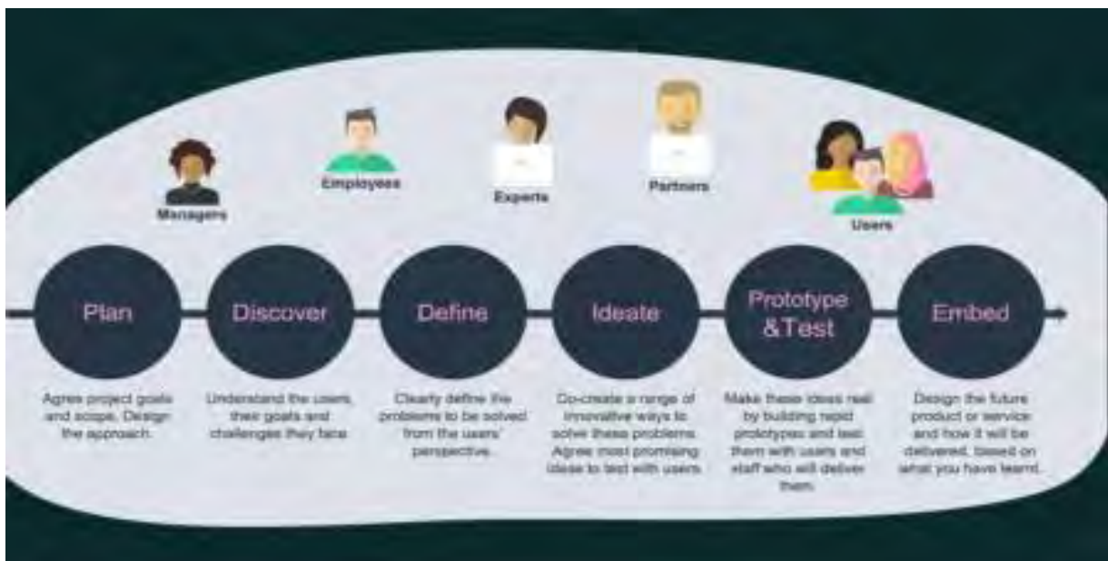
Figure 2: Extracted from the report 'Human centred design workshop. Exploring HCD methods to improve the digital transformation of frontline mental health services in the East of England. Illustration from PA Consulting & Think Lab Cambridge University.

There are six stages to the HCD methodology: plan, discover/empathise, define, ideate, prototype and test, embed.