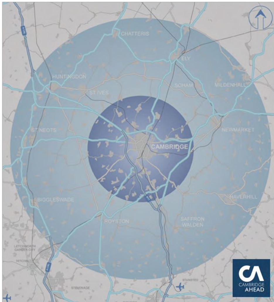
Figure 1 Cambridge city region (previously known as Cambridge Ahead area)

The Cambridge based companies were then selected as companies with either their registered office, or their primary trading address, in one of the Cambridge city region postcodes. The location of each company for mapping purposes was taken to be the postcode of its primary trading address. In many cases the primary trading address was not provided. In general, the registered office address was then used as the location postcode. However, in many cases local knowledge and internet searches enabled us to identify a primary trading address despite it not being found on FAME. The whole of a company’s operations is displayed at its primary trading address even if it operates at several locations in the Cambridge area. The database has 26,000 Cambridge based companies in the Cambridge city region alive in 2023/24.