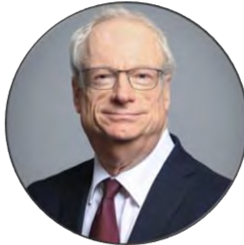
Lord Chris Smith

Key takeaways and future collaboration opportunities