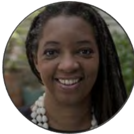
Sonita Alleyne OBE Master Jesus College

Setting the scene: the role of policy in shaping cultural sustainability